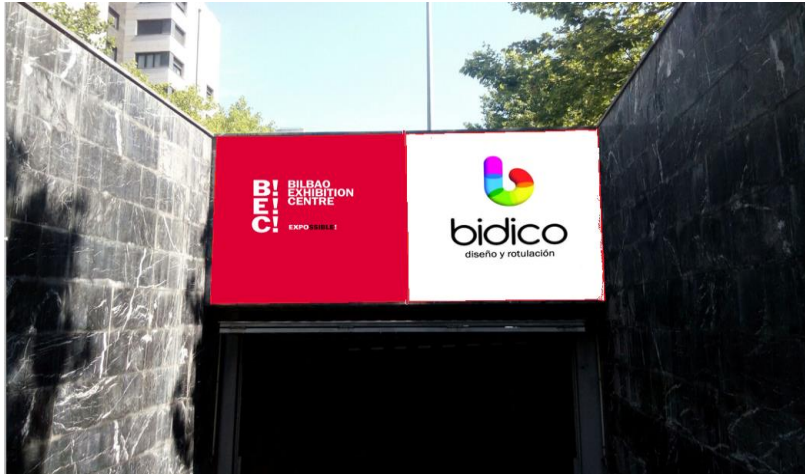
Image over the car park access door

Showcase your brand to visitors arriving at the venue in their private cars. Upon entrance to the car park tunnel, your brand will be showcased on a very large sign.